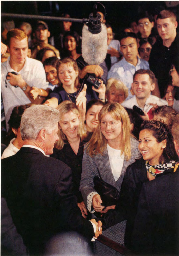
Above: Pressing the flesh. President Bill Clinton, foreground , shakes hands with some of the enthusiastic AU students who surged down to the front of the stage following the president's speech. Above right: A new vision. Calling America's diversity, "a huge gift in a global economy and a global society," Clinton said, "We can study the demographic patterns and know what America will look like in the twenty-first century, but we have to look inside to imagine what America will be like . . ." Below right: AU applause. Clinton responds to the crowd's enthusiasm.